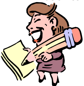
Flowing arguments is critical to responding effectively--so practice!

1. US. Econ. fail. Elpha '10 will see 2% GNP drop. Inflation come back